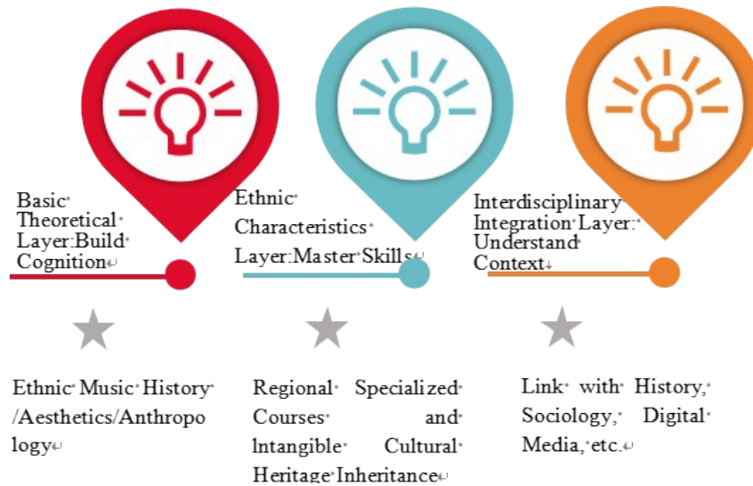
Figure 1 Immersion curriculum system of national culture

Instrumental Composition," incorporating representative pieces and skills from intangible cultural heritage projects to achieve simultaneous transmission of musical techniques and cultural essence. The interdisciplinary integration layer introduces courses like "Ethnic Music and Folk Culture" and "Digital Dissemination of Ethnic Music," leveraging resources from history, sociology, and digital media to guide students in understanding ethnic music's cultural context from multiple perspectives. This creates a comprehensive curriculum chain spanning "theoretical cognition, skill mastery, and cultural interpretation," ensuring ethnic culture permeates the entire educational process.